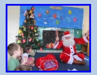
Right before our Christmas break, Santa came to see us. And he didn't come empty-handed! Thank you Santa!